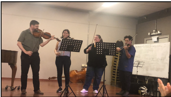
Viola recital at the national university of Córdoba

It is strange to think about from the US, but here October and November correspond to April and May in the US and all that it includes in the scholastic year. It is a very busy time of the year with very many activities going on at the same time. We are looking forward to December when a lot of the extra events and classes will close for Summer vacation!