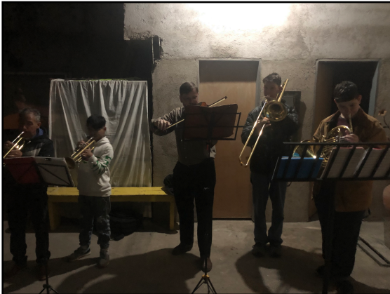
Playing music and Preaching in the dark