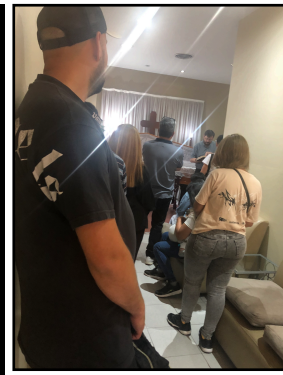
Preaching at a funeral