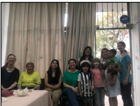
The monthly ladies meeting and Bible study

We definitely need and count on your prayers!