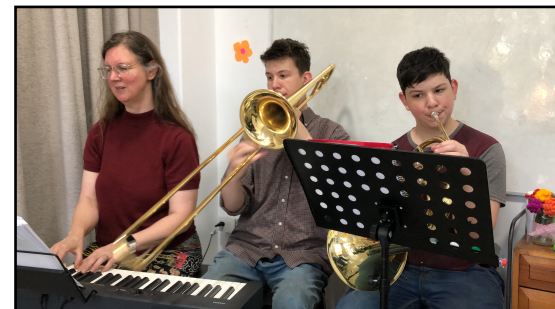
The singing and music for our Sunday service has been a source of blessing during the last month

Thank you for your support in prayer and please don't stop! We love you all so much and appreciate all that you do for His kingdom!